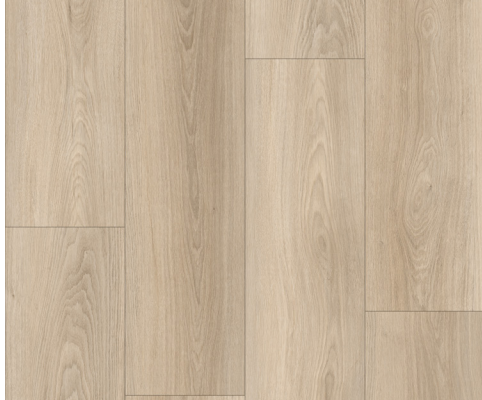
Moraga | CTLV0401