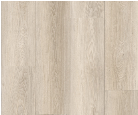
Belvedere | CTLV0404