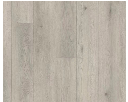
Granville | CTLV0406