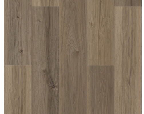
Balboa | CTLV0403